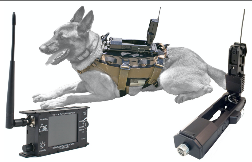
Part #: TSE-K9-KIT-WP-3.5-V2

The NEW Waterproof High Power K9 Camera Kit from Tactical Support Equipment Inc. is waterproof, salt water resistant with internal battery compartment. The system now incorporates a Color Day/Night Camera that visually outperforms any other K9 Camera in low light situations. The infrared illuminator is now controlled by the camera, so it is able turn the illuminator on and off as needed and save battery life.